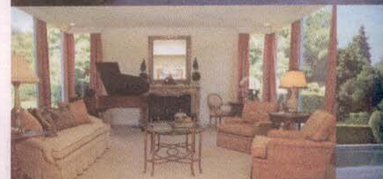
6 BEDROOM GATED ESTATE WITH GUEST HOUSE IN MONTECITO